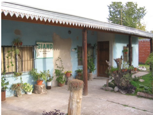
Siand foster home, Buenos Aires