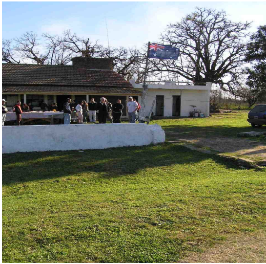
Nuevo Horizonte Juvenil , Moreno, Argentina