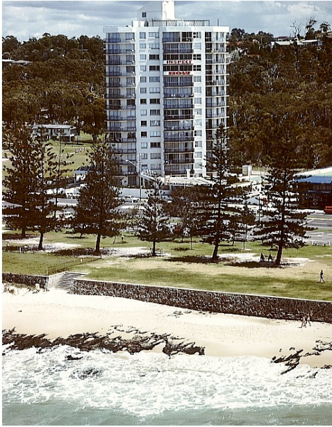
Sunshine Coast Residential Tower

Member CII / QUT Research Task Force, Re-engineering the Construction Delivery Process