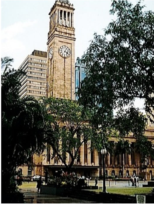
Brisbane City Hall Restoration