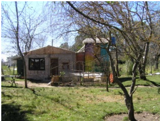
Civil Los Honeros, Moreno, Argentina School house