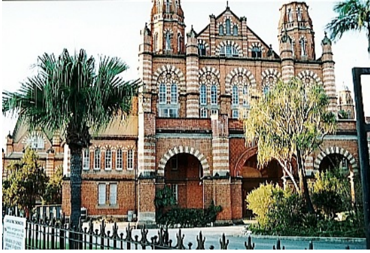
Old Queensland Museum – heritage listed refurbishment