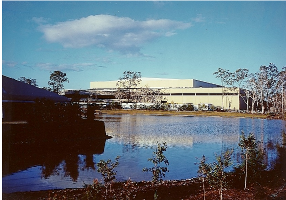
Boondall Entertainment Centre, 15,000 max capacity