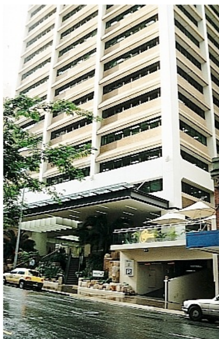
127 Creek Street, Office block redevelopment

Adjudication Online Case Management System.