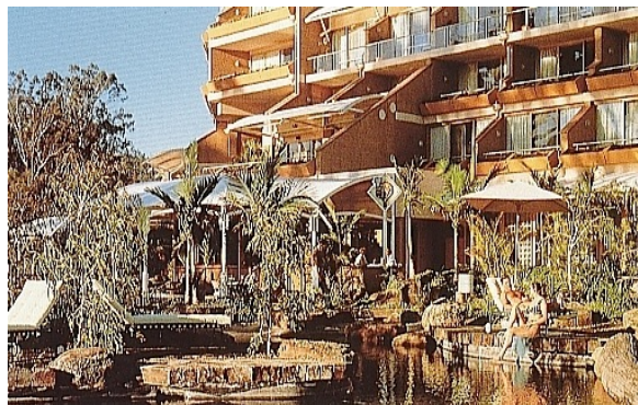
The Kooralbyn Hotel – 5 storey rammed earth construction