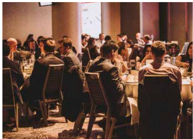
VIC/TAS Annual Chapter Dinner

In addition to the APC Interviews, the Chapter Council has been reviewing and endorsing CQS Applications from the VIC Chapter members. We do this monthly at our Chapter meeting.