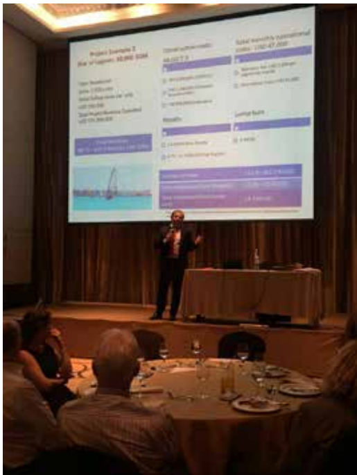
Thailand CPD Event

As a membership promotion, two refresher workshops for referred APC candidates were conducted within this period. For further membership promotion five various events such as Membership Induction sessions, APC mock interviews etc. were conducted during this period.